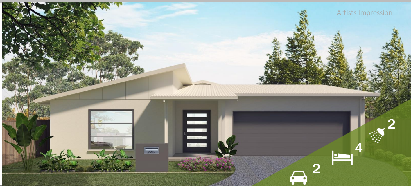
North to rear, Torrens Title, 4 bedroom home